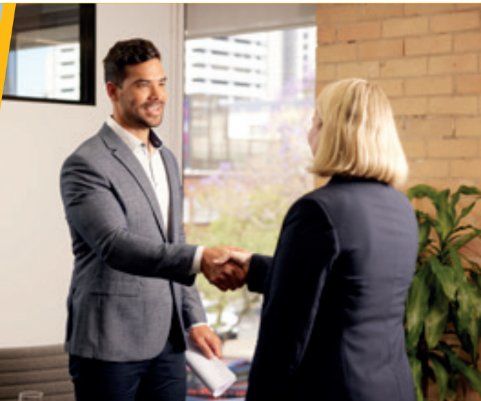
RSL Employment Program