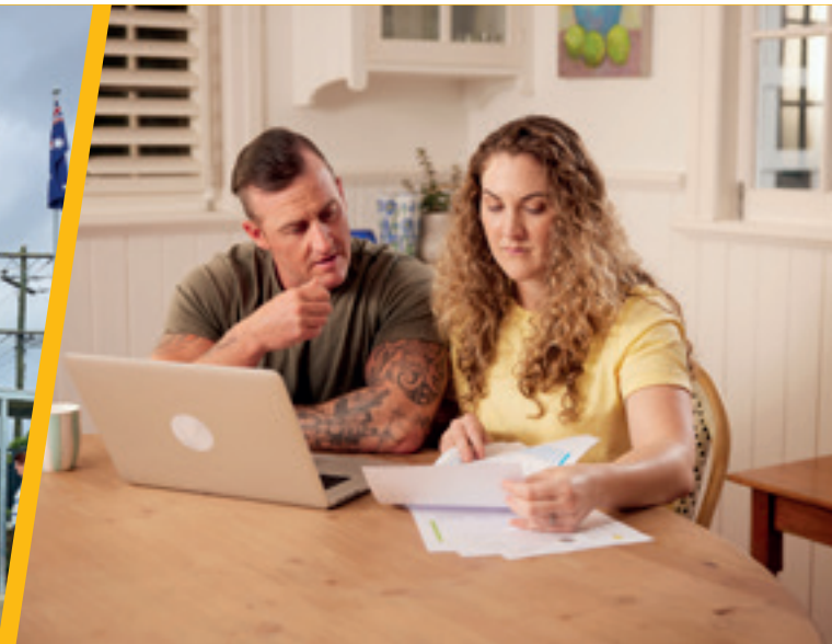
Emergency financial support