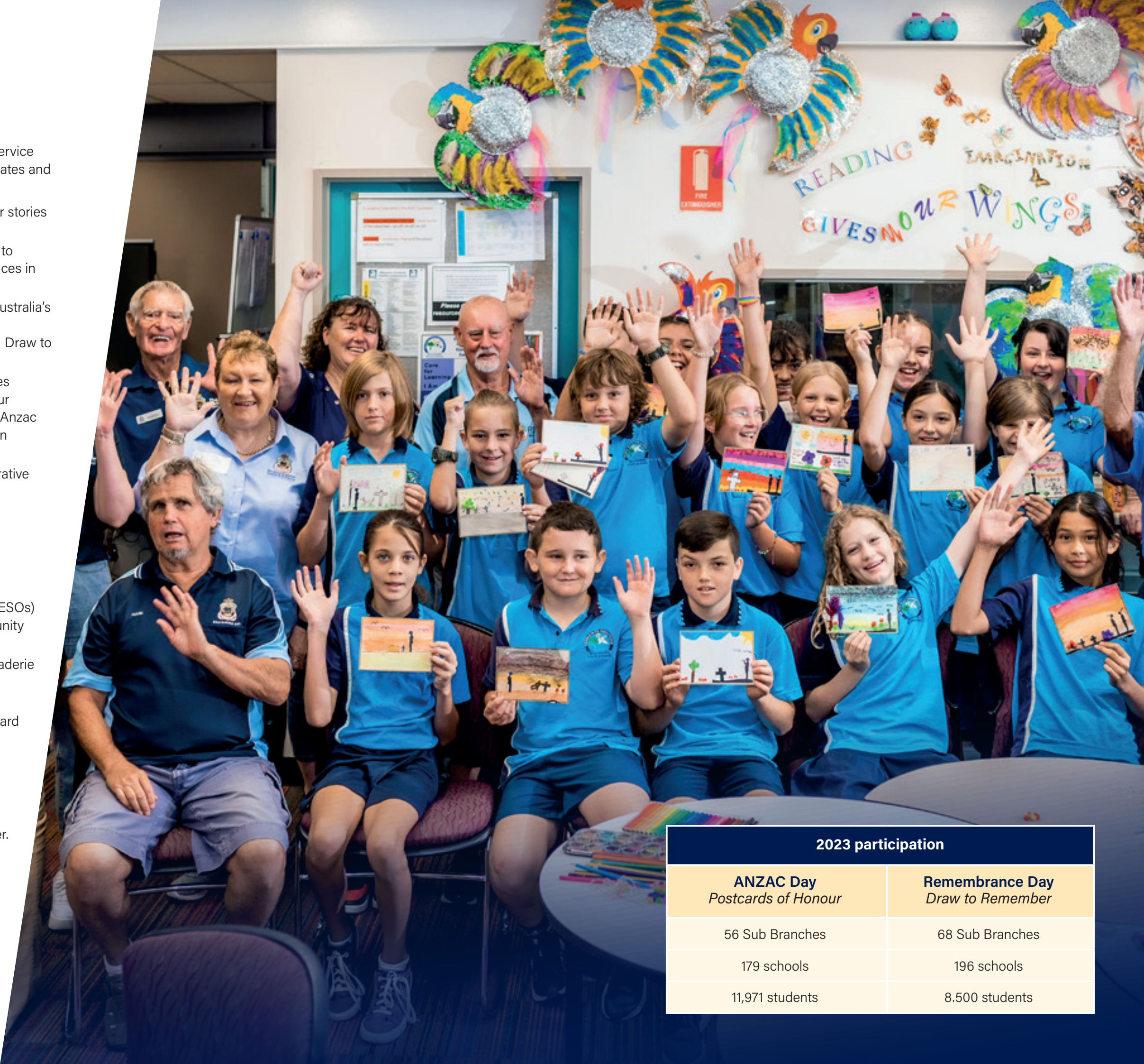
Beachmere State School students participated in the Postcards of Honour initiative, with the help of Brisbane North District members.