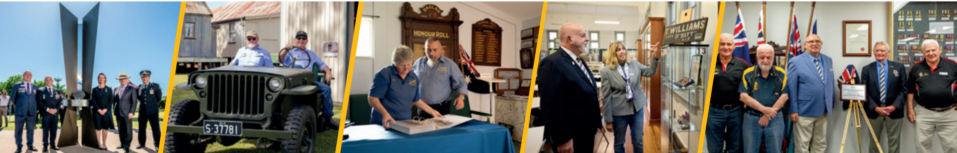
Sunshine Coast and Regional

After three years of hard work, Forest Lake & Districts RSL Sub Branch has a purpose-built clubhouse that members are proud to call home. In 2019, the local National Servicemen's Association (Nashos) gifted the Sub Branch a derelict WWII building in the Wacol Heritage Precinct. Formerly part of the Wacol Army Barracks, the Precinct includes a chapel and hall managed by the Nashos, and a military museum run by the Papua New Guinea Volunteer Rifles and Ex-Members Association Inc.