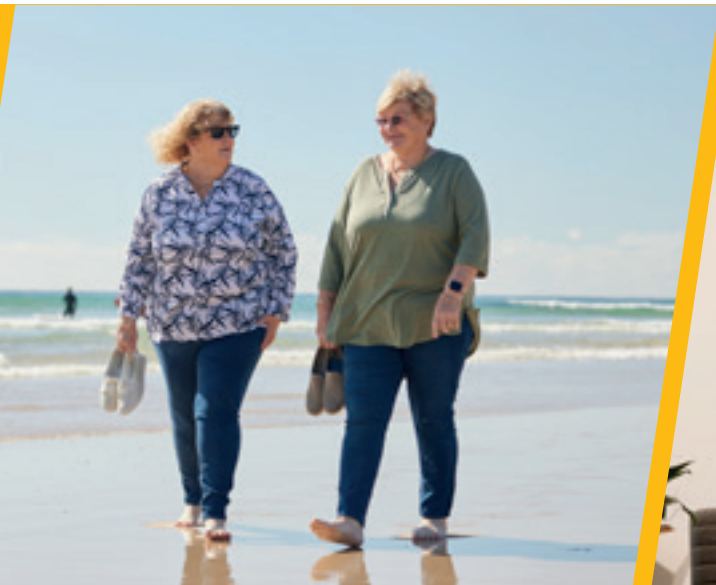
Operation PTSD Support