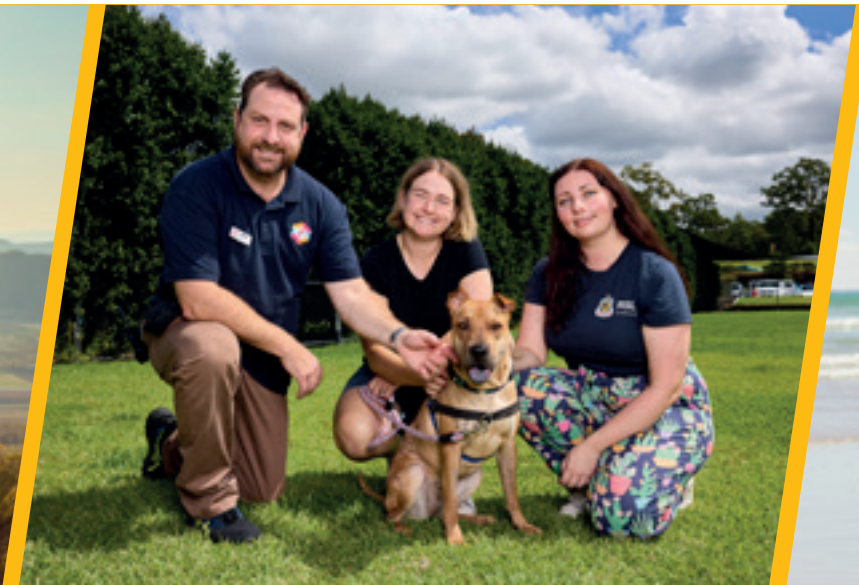
Happy Paws Happy Hearts