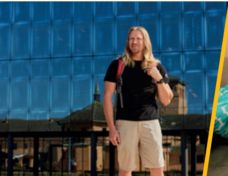
RSL Scholarships Program

In 2023, 107 veterans were referred to Bravery Trust for financial counselling.